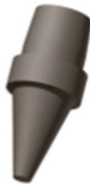
Condenser Dome Hood Spray Nozzle