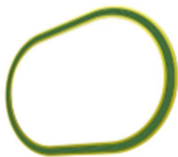
Feedwater Heater Obway Manway Gasket