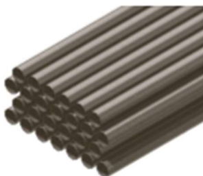
Condenser and Feedwater Heater Tubes