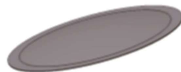
Condenser Rupture Disc