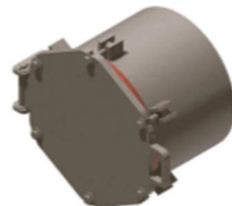
Condenser Manway Assembly