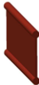
Condenser Rubber Dogbone Expansion Joint