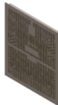
Condenser Tube Sheet