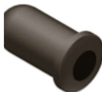
Condenser Tube Plug