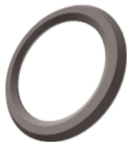
Feedwater Heater Torus Ring