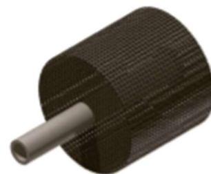
Condenser Basket Tip